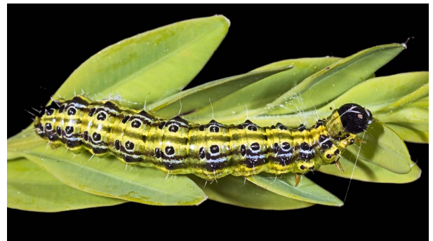
Mature box tree moth larvae.