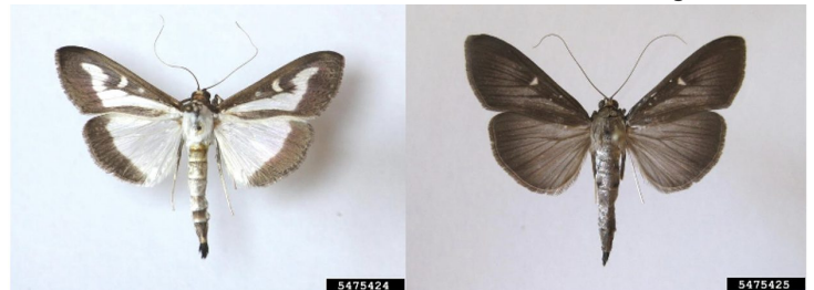
Adult box tree moths, white form (left) and brown form (right). Note the distinct white marking in the middle of the forewing.

brown form has solid brown wings and body. Both forms have a characteristic white mark in the middle of each forewing.