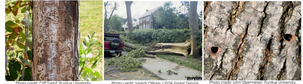
Emerald ash borer is more easily recognized by its damage than by the beetle itself. The first image shows the typical s-shaped patterns that appear under the bark of trees damaged by emerald ash borer. The second image shows how ash trees killed by emerald ash borer can break and shatter in unexpected ways. The third image is of the d-shaped exit holes emerald ash bores make in tree bark.

prevent it from spreading further. These efforts have been highly successful in the past and have kept the beetle from destroying our urban and rural forests.