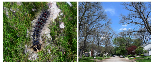
Photo credit: Elizabeth Barnes, Purdue University Photo credit: Elizabeth Barnes, Purdue University The soon to be renamed spongy moth (formerly gypsy moth) and the damage it can cause.

Treatments: Insecticide treatments for emerald ash borer are highly effective and often cheaper than tree removal. If a tree has been killed by emerald ash borer, it is critical to have it removed by a certified arborist . These trees are highly unpredictable and have caused serious injury and death even in calm weather conditions.